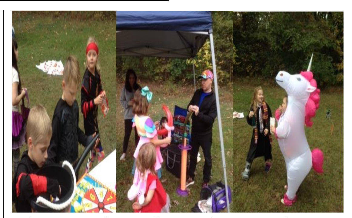
Above are pictures from our Halloween Parade & Party in October

Advertising Rates: Business card size: $20.00 One-fourth page: $35.00 One-third page: $45.00 One-half page: $60.00 Full page: $100.00