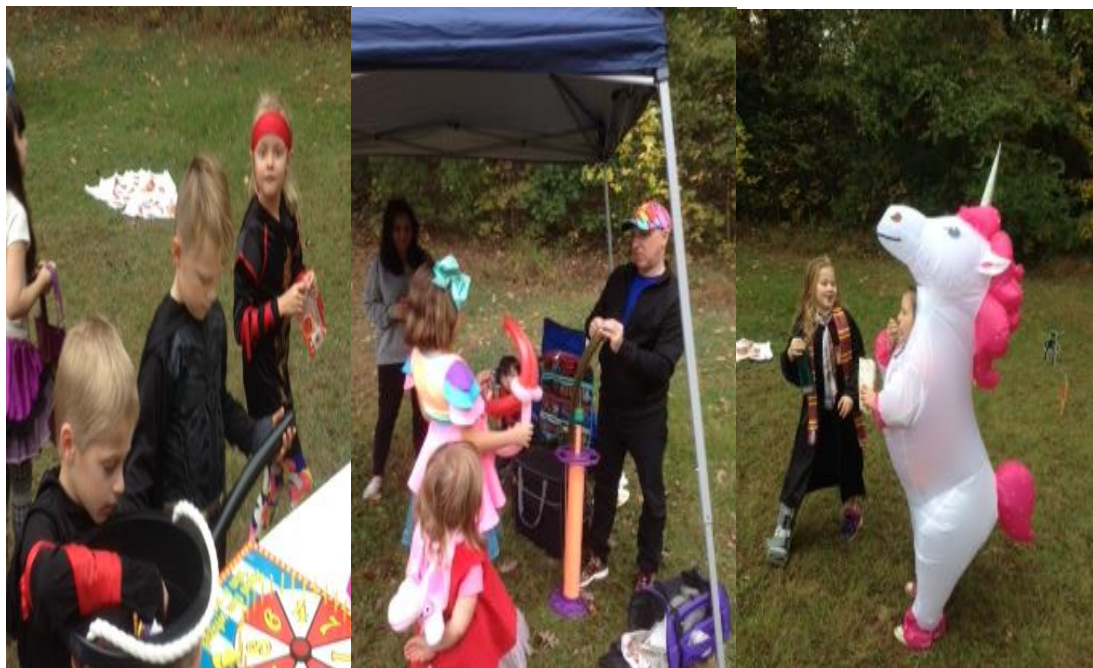
Above are pictures from our Halloween Parade & Party in October

Advertising Rates: Business card size: $20.00 One-fourth page: $35.00 One-third page: $45.00 One-half page: $60.00 Full page: $100.00